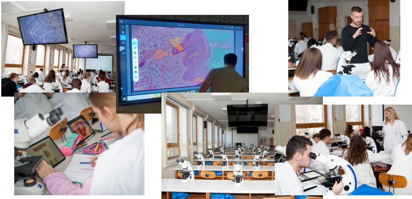
Survey of the innovation in education